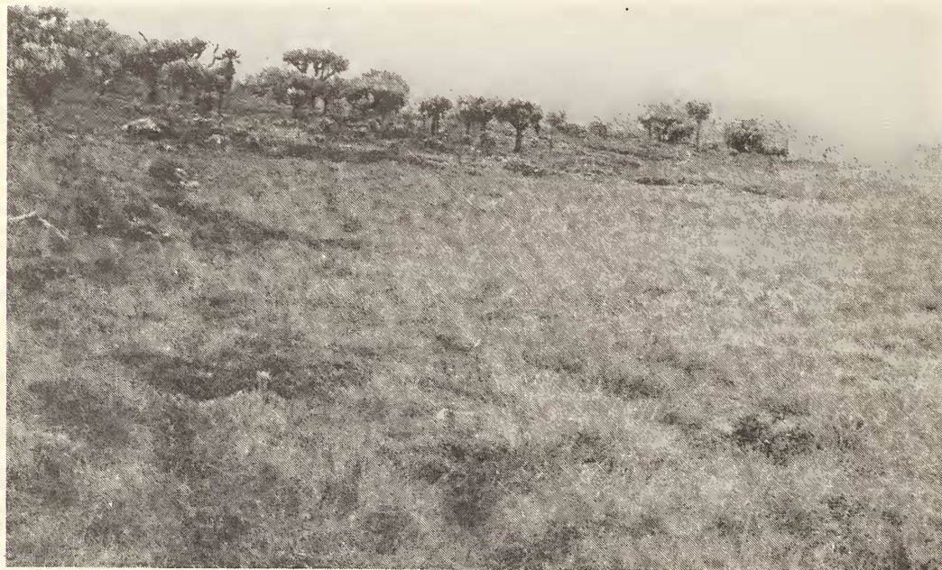
Fig. 3 Carex runssorensis bog ( Carex bog type 1, cf. Table 2, plot 13) in the caldera of Mt. Elgon (Koitoboss swamp). Patches of Alchemilla johnstonii can be detected between the Carex tussocks. The slopes in the background are covered by the Dendrosenecio barbatipes -Community (Foto: E. Beck, March 15th, 1983).